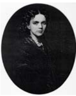
810b. Portrait of a Lady, mid to late 1860s, Paris Oil on canvas, oval Signed and dated lower right: Fr Winterhalter / Paris 186[?] Private Collection