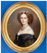
754. Sophie, Queen of the Netherlands (1818-1871), née Herzogin von Württemberg , 1863 Oil on canvas, 74.0 x 60.0 cm Signed lower left: fr Winterhalter Rijksmuseum, Amsterdam