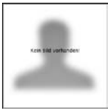
727. Countess Lilly Orlova , c. 1862-64 Oil on canvas Present location unknown