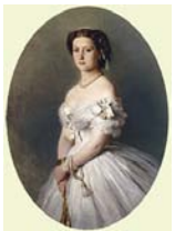
801. Helena, Princess of Great Britain & Ireland (1846-1923), Fürstin von Schleswig-Holstein-Sondenburg-Augustenburg , 1865, Rosenau