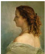
698. Eugénie, Empress of the French (1826-1920), née Condessa de Montijo de Teba de Guzman , 1861, Paris Oil on canvas, 54.5 x 45.5 cm (approx) Signed and dated lower left: Fr Winterhalter / 1861 Present location unknown / disputed