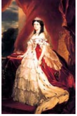
706. Augusta, Empress of Germany & Queen of Prussia (1811-1890) , née Prinzessin von Sachsen-Weimar-Eisenach, 1861 Oil on canvas, 271.0 x 180.0 cm Missing since 1945 (image known from a copy)