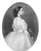
802. Louise, Princess of Great Britain & Ireland (1848-1939), later Duchess of Argyll , 1865, Rosenau