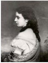
789. Marie-Therese, Prinzessin von Württemberg (1845-1927), née Erzherzogin von Österreich, Prinzessin von Ungarn , c. 1864 Oil on canvas Present location unknown