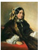
704. Victoria, Duchess of Kent (1768-1861), née Prinzessin von Sachsen-Coburg-Saalfeld , 1861, London (posthumous) Oil on canvas, 91.1 x 71.1 cm Signed and dated: Fr Winterhalter / 1861 . Inscribed on the back with the names of artist and sitter and as painted from recollection, June 1861 HM Queen Elizabeth II