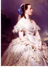
747. Marie-Henriette, Duchesse de Brabant (1836-1902), née Erzherzogin von Österreich, Prinzessin von Ungarn, later Queen of the Belgians, 1863, Brussels