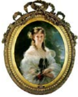
752. Duchesse Sophie de Morny (1838-1896), née Princess Troubetzkaia , 1863, Paris Oil on canvas, 94.0 x 73.0 cm, oval Signed, dated and inscribed lower left: fr Winterhalter / 1863 Musée National du Château de Compiègne