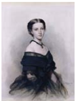
702. Helena, Princess of Great Britain & Ireland (1846-1923), later Fürstin von Schleswig-Holstein-Sonderburg-Augustenburg , 1861, London Oil on canvas, 53.7 x 40.6 cm Signed and dated lower right: Fr Winterhalter / 1861 . Inscribed on the back with the names of artist and sitter HM Queen Elizabeth II