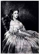
726. Mlle la Princesse Murat , c. 1862 Oil on canvas Present location unknown