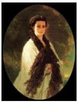
764. Elisabeth, Empress of Austria, Queen of Hungary (1837-1898), née Herzogin in Bayern , 1864, Schönbrunn Oil on canvas, oval Signed, dated and inscribed lower left: Fr Winterhalter / Schönbrunn 1864 Private Collection, on loan to Hofburg [Kunsthistorisches Museum Gemäldegalerie, Vienna]