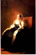
719. Eugénie, Empress of the French (1826-1920), née Condessa de Montijo de Teba de Guzman , 1862, Paris Oil on canvas, 229.0 x 146.0 cm Signed F Winterhalter 1862 in the lower left hand corner. In the upper left hand corner are the coat of arms of the House of Teba and the French eagles beneath the Imperial Crown, followed by the inscription in capital letters Maria Eugenia Guzman / Comitissa Tebae / Gallorum Imperatrix / MDCCCLXII . Private Collection