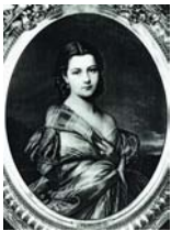
749. Lady Mary Douglas-Hamilton (1850-1922), later Princesse de Monaco, Fürstin Festetics von Tolna, c. 1863

The National Trust for Scotland, Brodick Castle