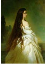
763. Elisabeth, Empress of Austria, Queen of Hungary (1837-1898), née Herzogin in Bayern , 1864, Schönbrunn Oil on canvas, 158.0 x 117.0 cm Signed, dated and inscribed lower right: Fr Winterhalter / Schönbrunn 1864 Hofburg [Kunsthistorisches Museum Gemäldegalerie, Vienna]