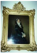
765. Sophie, Erzherzogin von Österreich, Prinzessin von Ungarn (1805-1872), née Herzogin von Bayern , 1864, Vienna Oil on canvas Signed, dated and inscribed lower right: Fr Winterhalter / Wien 1864 Private Collection