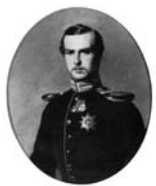
703. Ludwig IV Großherzog von Hessen und bei Rhein (1837-1892) , 1861, London Oil on canvas, 75.6 x 61.0 cm, oval Inscribed on the back with the names of artist and sitter and the date, June 1861 HM Queen Elizabeth II