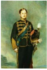
787. Albert Edward, Prince of Wales (1841-1910), later Edward VII, King of Great Britain & Ireland , 1864, London Oil on canvas, 162.2 x 114.0 cm Signed and dated, bottom left: Fr Winterhalter 1864 HM Queen Elizabeth II