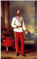
790. Franz Joseph I, Emperor of Austria, King of Hungary (1830-1916) , 1865, Vienna Oil on canvas, 255.0 x 133.0 cm Signed and dated lower left: F.X. Winterhalter. 1865 Hofburg [Kunsthistorisches Museum Gemäldegalerie, Vienna]