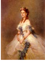
788. Alexandra, Princess of Wales (1844-1925), later Queen Alexandra, née Princess of Denmark , 1864, London Oil on canvas, 162.2 x 114.0 cm Signed and dated, bottom left: Fr Winterhalter 1864 HM Queen Elizabeth II