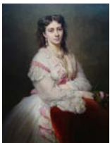
797. Countess Maria Branicka de Bialacerkiew (1843- 1919), née Princess Sapieha-Rozanska, 1865, Paris Oil on canvas, 115.9 x 89.9 cm Signed, dated and inscribed lower right: F. Winterhalter 1865. Paris Philadelphia Museum of Art, Philadelphia, PA