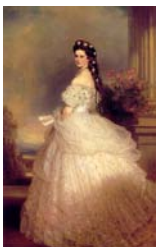
791. Elisabeth, Empress of Austria, Queen of Hungary (1837-1898), née Herzogin in Bayern , 1865, Vienna Oil on canvas, 255.0 x 133.0 cm Signed and dated lower left: F.X. Winterhalter. 1865 Hofburg [Kunsthistorisches Museum Gemäldegalerie, Vienna]