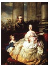
729. Kronprinz Friedrich Wilhelm (1831-1888) and Kronprinzessin Victoria (1840-1901) von Preußen , with their two children, Prinz Wilhelm (1859-1941, later Emperor of Germany & King of Prussia) and Prinzessin Charlotte (1860-1919, later Herzogin von Sachsen-Meiningen) , 1862, Berlin & Paris Oil on canvas, 248.3 x 180.3 cm Signed and dated: Fr Winterhalter / 1862 HM Queen Elizabeth II