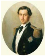
800. Alfred, Prince of Great Britain & Ireland, Duke of Edinburgh (1844-1900) , 1865, Rosenau