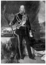
705. Wilhelm I, Emperor of Germany & King of Prussia (1797-1888) , 1861 Oil on canvas, 271.0 x 180.0 cm Missing since 1945 (image known from a copy)