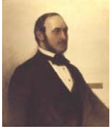
700. Prince Albert, the Prince Consort (1819-1861) , 1861, London (posthumous) Oil on canvas, 76.0 x 63.5 cm Signed and dated lower right: f. Winterhalter / 28 December 1861 Private Collection