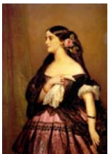
755. Mme Adelina Patti (1843-1919) , 1863, Paris Oil on canvas, 110.0 x 77.9 cm Signed and dated lower left: F. Winterhalter 1863 Private Collection