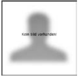
799. Mme Dollfuss , c. 1865