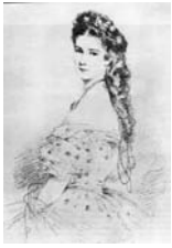
792. Elisabeth, Empress of Austria, Queen of Hungary (1837-1898), née Herzogin in Bayern, 1865, Vienna Pencil on paper Signed lower right: F.X. Winterhalter Present location unknown