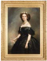
753. Sophie, Queen of the Netherlands (1818-1871), née Herzogin von Württemberg , 1863 Oil on canvas, 132.0 x 92.0 cm Signed and dated lower left: fr Winterhalter / 1863 HM Queen Beatrix