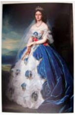
809. Olga, Queen of Württemberg (1822-1892), née Grand Duchess of Russia, 1865 Oil on canvas, 240.0 x 150.0 cm Signed & dated lower right centre: Fr. Winterhalter 1865 Württembergisches Landesmuseum, Stuttgart