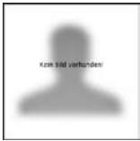
759. Countess Tyszkiewicz , c. 1863-64 Oil on canvas Present location unknown