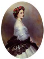
701. Alice, Princess of Great Britain & Ireland (1843-1878), later Großherzogin von Hessen und bei Rhein , 1861, London Oil on canvas, 118.7 x 88.9 cm Signed and dated lower right: Fr Winterhalter / 1861 HM Queen Elizabeth II